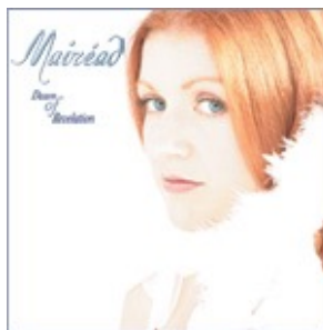
Dawn of Revelation