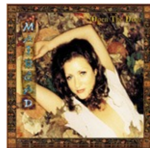
Open The Door